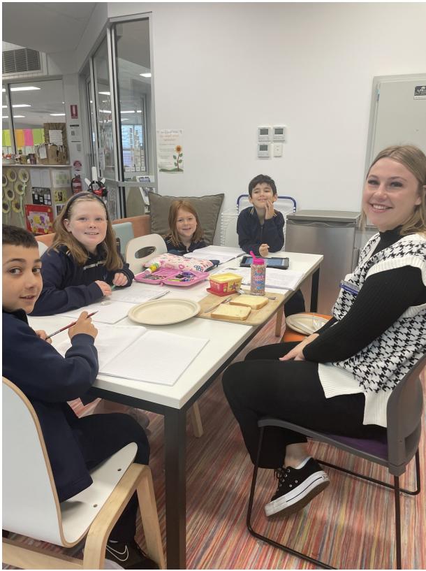
"Year 4 Geography Test"