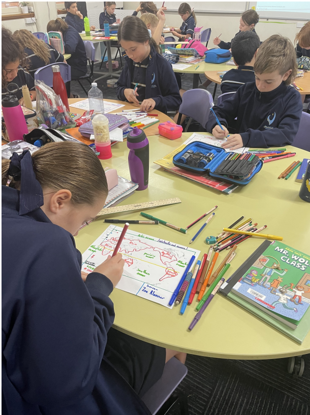
"Year 1 Money task to establish prior knowledge"